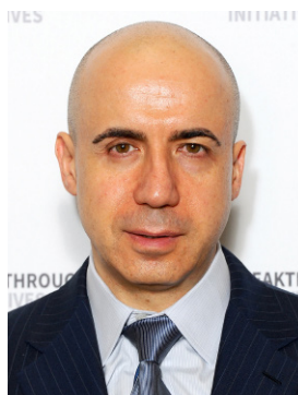
YURI MILNER FOUNDER, DST GLOBAL