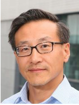
JOSEPH TSAI EXECUTIVE VICE CHAIRMAN, ALIBABA GROUP

Joseph C. Tsai joined Alibaba Group in 1999 as one of the eighteen founders. He served as Chief Financial Officer until May 2013 and is currently the Executive Vice Chairman of the company. Joe oversees Alibaba's strategic acquisitions and investments. He has been a member of the company's Board of Directors since its inception, and is a founding member of the Alibaba Partnership, serving on its Partnership Committee.